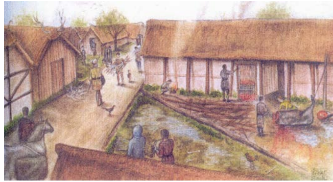
Buildings in Saxon London