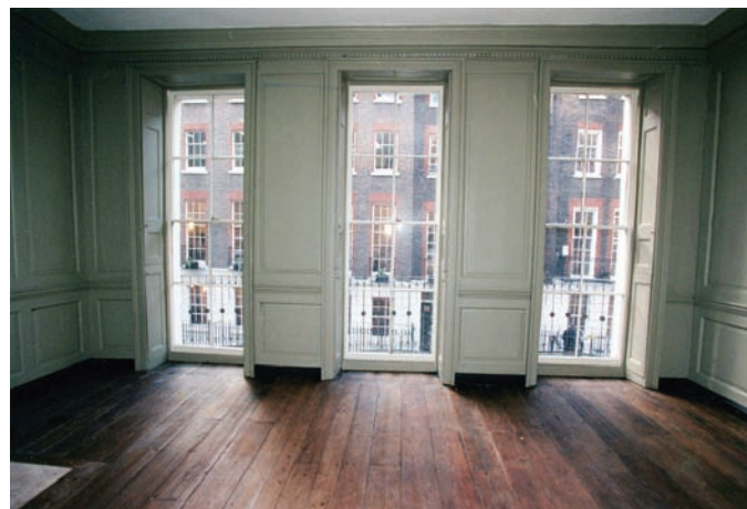
Benjamin Franklin's parlour